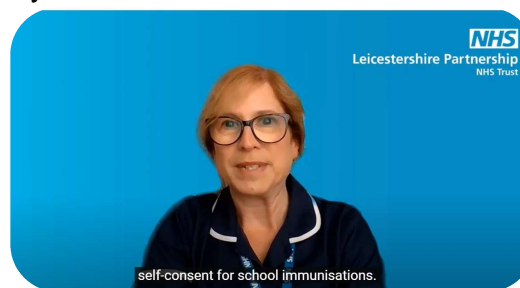
Our Clinical Lead explains self-consent tiny.cc/selfconsent

You can also let us know if you do not want the young person to be vaccinated.