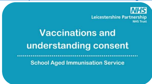
Vaccinations and understanding consent tiny.cc/vaccinationsandconsent

www.leicspart.nhs.uk/service/schoolagedimms or you can watch these videos below: